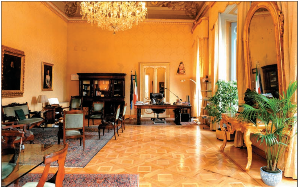
A view of the President's study