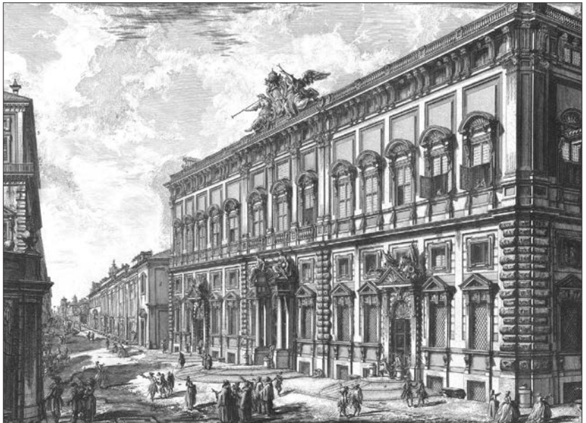
The Palazzo della Consulta in a famous etching by Giovanni Battista Piranesi

The "incidental" system of constitutional review means that statutes cannot simply be brought immediately and directly before the Court for review by anyone who claims they are unconstitutional. There must be a pending case in which a judge needs to apply the statute and therefore cer-