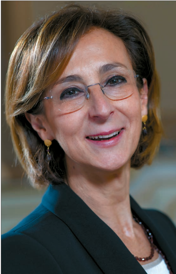
Marta Cartabia, President of the Italian Constitutional Court