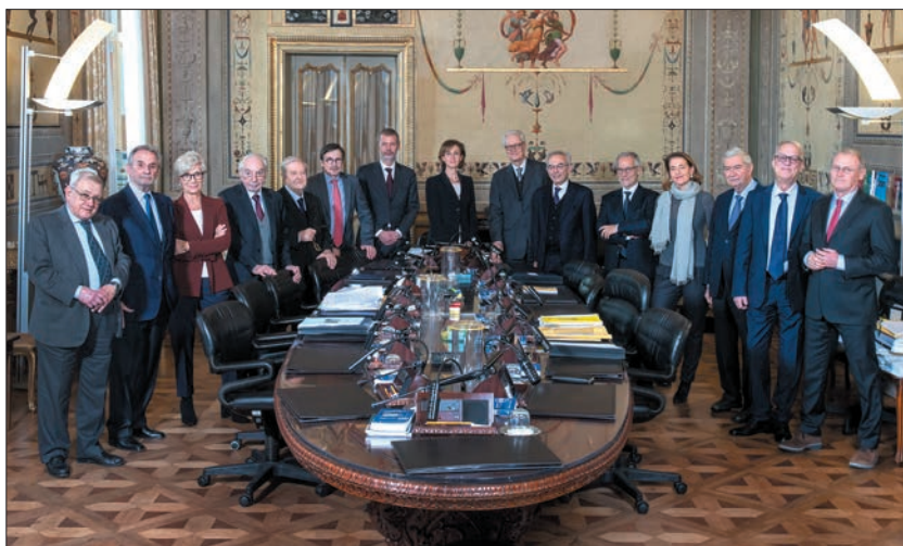
The Constitutional Court meeting in closed session in the Salone Pompeiano (February 2020)