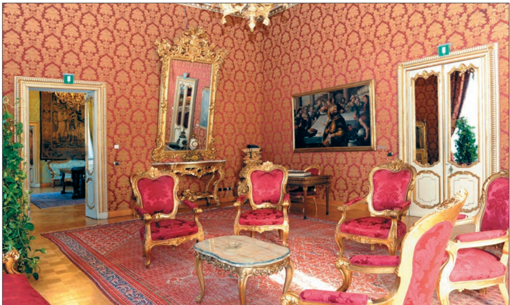
The Salotto rosso with Tintoretto's Le Nozze di Cana