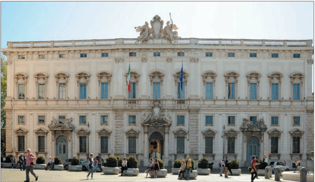
Palazzo della Consulta