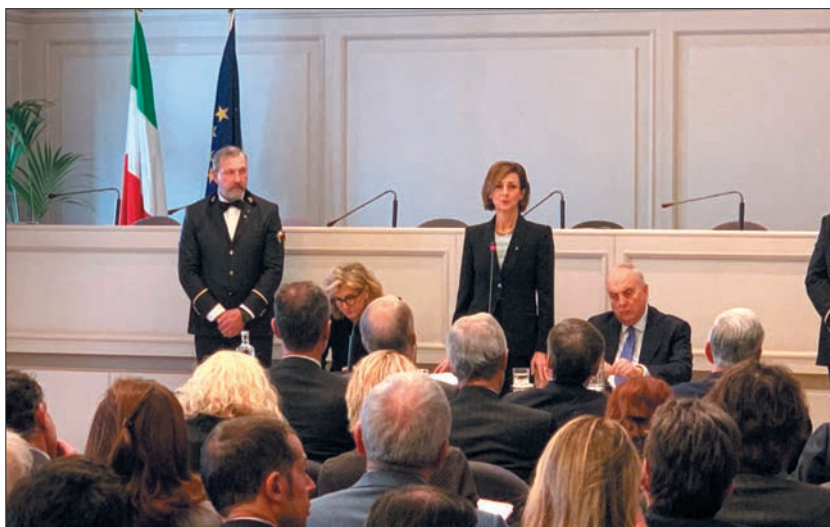
President Cartabia meets the press after his election (11 December 2019)

Piero Calamandrei, a member of the Constituent Assembly and an expert in procedural law and constitutional adjudication, and Massimo Severo Giannini, former Head of Cabinet at the Ministry for the Constituent Assembly.